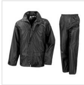
Soft Cold Room Suit