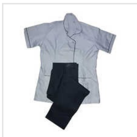
Cotton Hospital Nurse Uniform