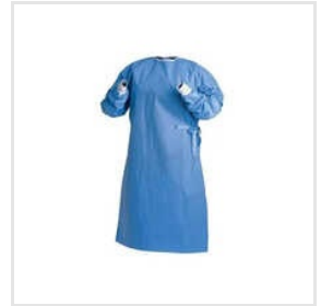
PP SMS And SSMMS Gown