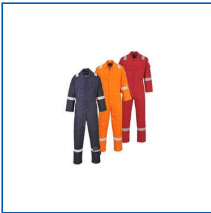
INDUSTRIAL BOILER SUIT

Automobile Safety Suits, Automobile Sales uniform, Automobile Service Uniform Shirt, Automobile Worker Uniform, Automobile Worker Uniform Shirt, Cold Room Coverall, Cold Room Storage Suits, Cold Storage Wear Cold Resistant Suit, Cooperative Salesman Uniform, Cotton Hospital Nurse Uniform, Disposable Non Woven PPE Kit, Factory Worker Uniform Shirt, Formal Staff Uniform, Hard Cold Storage Suit, Honda 2 Wheeler Uniform, etc.