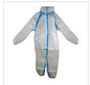
Disposable Non Woven PPE Kit