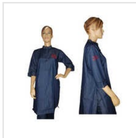
Polyester Nurse Uniform