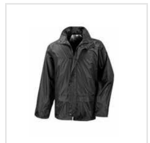
Hard Cold Storage Suit