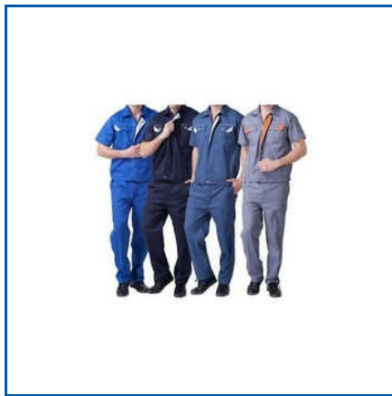
INDUSTRIAL WORKER UNIFORM