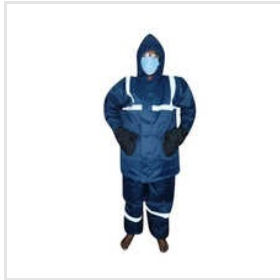
Cold Storage Wear Cold Resistant Suit