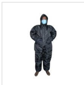
Cold Room Coverall