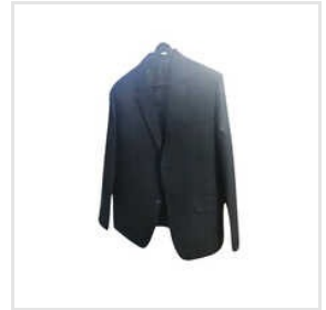
School Uniform Blazer