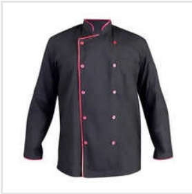
Hotel Chef Coat