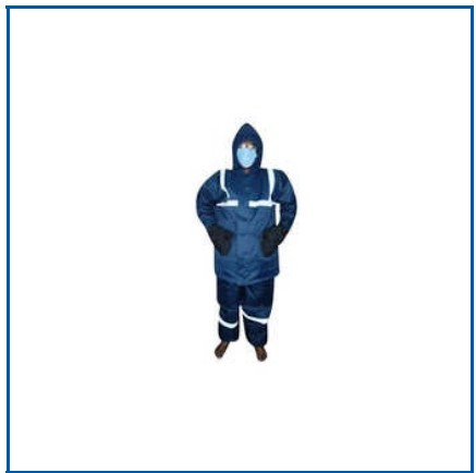
COLD ROOM STORAGE SUITS