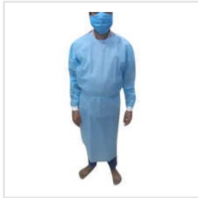
Non Woven Surgical Gown