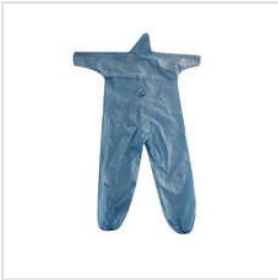
PP SMS And SSMMS PPE Kit