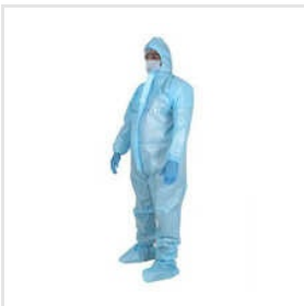
Non Woven PPE Kit